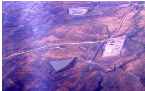
Aerial view of coalbed methane project in Wyoming's Powder River Basin.

Drilling into a coal seam will not by itself cause the methane to flow. The methane is held in the coal by the enormous pressure of water, and a company must first decrease the water pressure by 'de-watering' or pumping out the water. Months or even a couple of years of pumping may be necessary before the pressure is reduced enough for the methane to "desorb" from the coal.