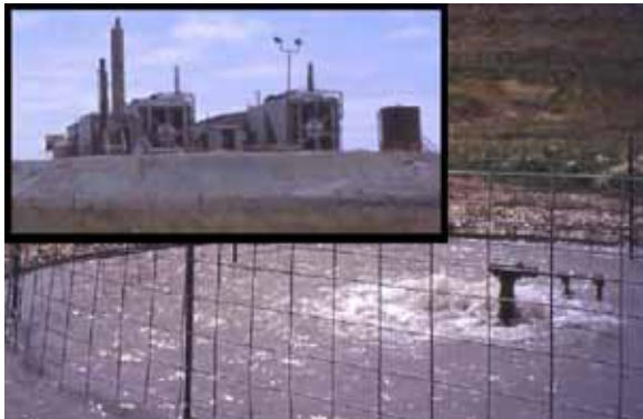
Compressor stations (inset), and a cattle watering tank that is now bubbling methane, not just water, in Wyoming.