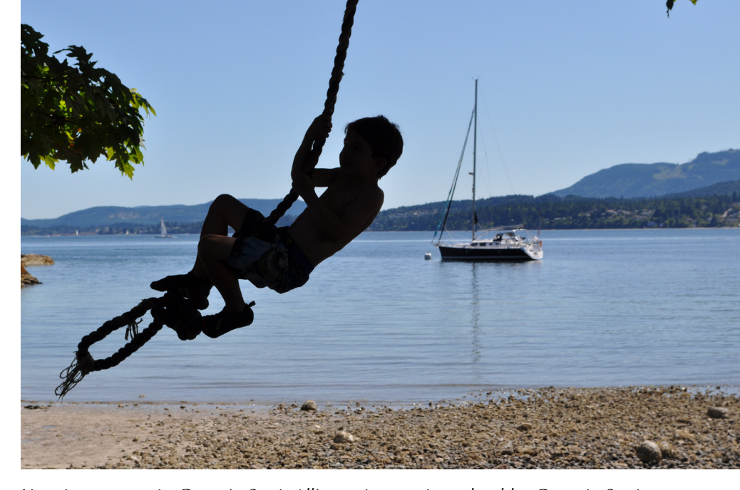
Your investment in Georgia Strait Alliance is ensuring a healthy Georgia Strait for the next generation to enjoy.