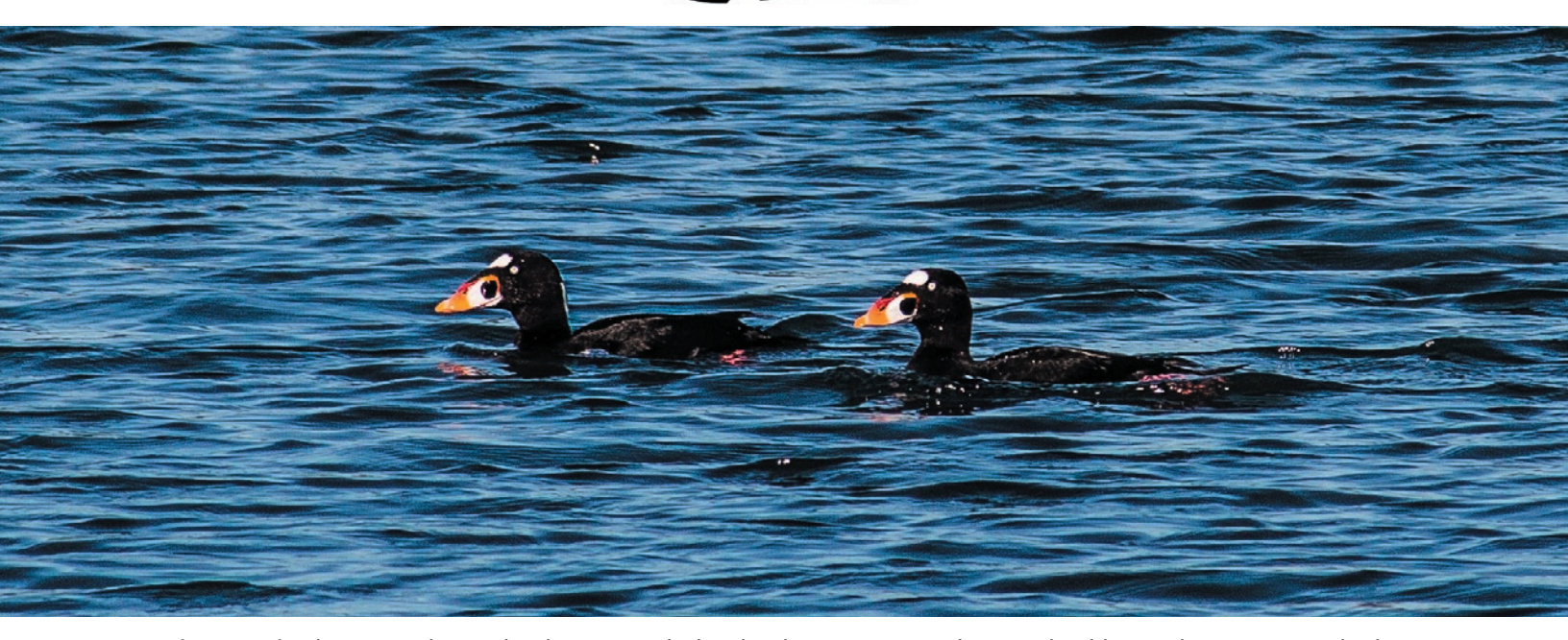
Surf scoters feeding near Thetis Island: GSA works hard to keep our coastal waters healthy, so that scoters and other species in our region can continue to thrive.