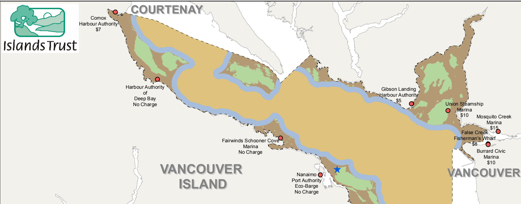
Illustration of Potential Effect of Transport Canada's Proposed Amendment to Section 96 of the Vessel Pollution and Dangerous Chemicals Regulations in the Islands Trust Area