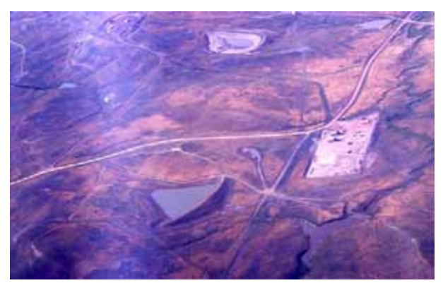
Aerial view of coalbed methane project in Wyoming's Powder River Basin.

Drilling into a coal seam will not by itself cause the methane to flow. The methane is held in the coal by the enormous pressure of water, and a company must first decrease the water pressure by 'de-watering' or pumping out the water. Months or even a couple of years of pumping may be necessary before the pressure is reduced enough for the methane to "desorb" from the coal.