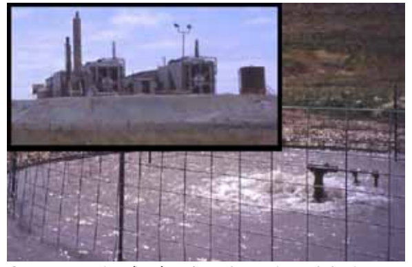
Compressor stations (inset), and a cattle watering tank that is now bubbling methane, not just water, in Wyoming.

<sup>[1]</sup> La Plata County Impact Report, October 2002; http://co.laplata.co.us/pdf/plan_doc/final_impactrpt/final_ir1.pdf