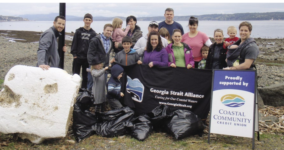
Beach cleanup photos by Ruby Berry, Cheryl Onciul and Michelle Young

Although air pollution has been generally decreasing in the Lower Mainland, GROUND LEVEL OZONE levels have shown a small but steady increase over the past decade, and Metro Vancouver officials are trying to determine the reasons for this. Ground level ozone is created by chemical reactions between nitrogen oxide emissions and volatile organic compounds in the presence of sunlight, and high levels can have detrimental effects on human health, crops and other vegetation.