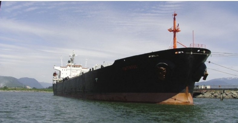
Tankers such as this could become a daily occurrence in Vancouver Harbour, tying up traffic in the Port as they transit both Narrows.