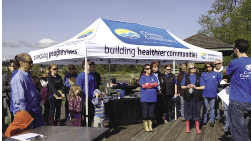
GSA and Coastal Community Credit Union cleaned beaches in Courtenay (above), Chemainus (below), Campbell River (page 11) and four more towns on Vancouver Island.

As well as meeting and talking with people around the Strait, our summer outreach team will be selling tickets for our 'Celebrate the Strait' Raffle, which has four great prizes. Be sure to get your tickets—they are a fun way to support our cause while giving you a chance to win some great prizes. Please see page 3 for details.