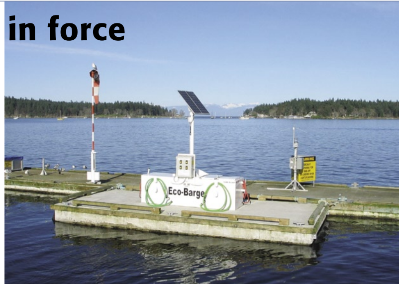
Free, solar-powered EcoBarge pump-out in Nanaimo.

The regulations also set out a list of specific designated areas where any discharge of raw sewage is prohibited (established as no-discharge zones by BC several years ago).