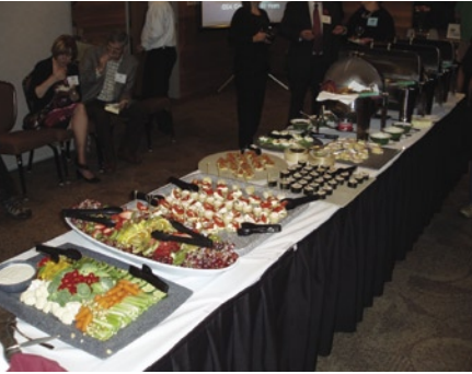
Delicious catering by the UVIC Faculty Club and Daniel's Patisserie.