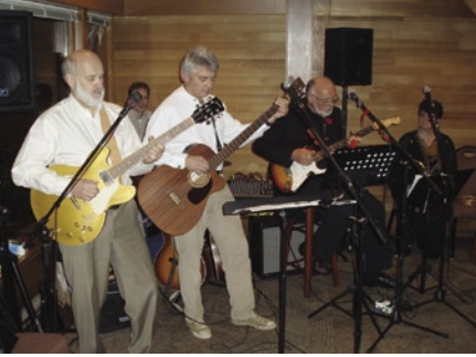
Entertainment by the Bald Eagles.