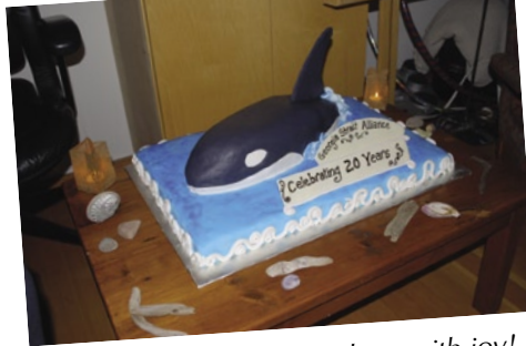
Even the cake seemed to leap with joy!

A big thanks also to all those individuals who made a donation at these events, who are included in the list on page 12.