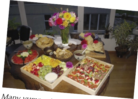
Many yummy treats were on hand.