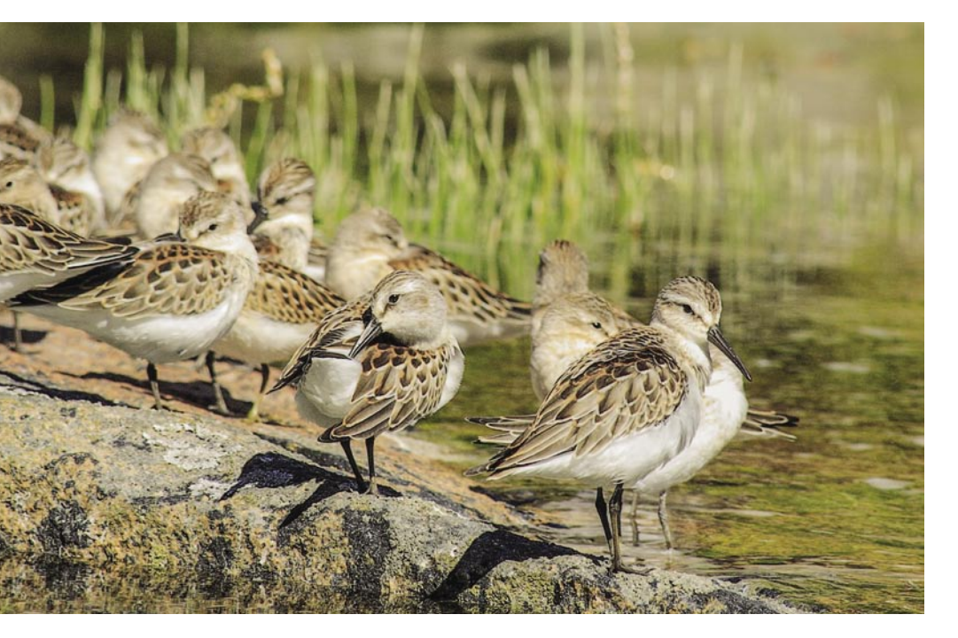
Sandpipers are among the diverse species that rely on the health of our local shores.

It is questions like these that have prompted GSA to embark on a new