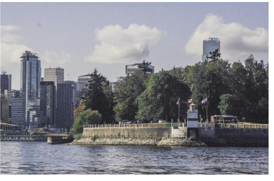
Brockton Point and the Stanley Park Seawall: a tranquil place in the midst of the city.

For updates and new developments in our exciting new Waterfront Initiative, watch the "Latest News" column at www.GeorgiaStrait.org.