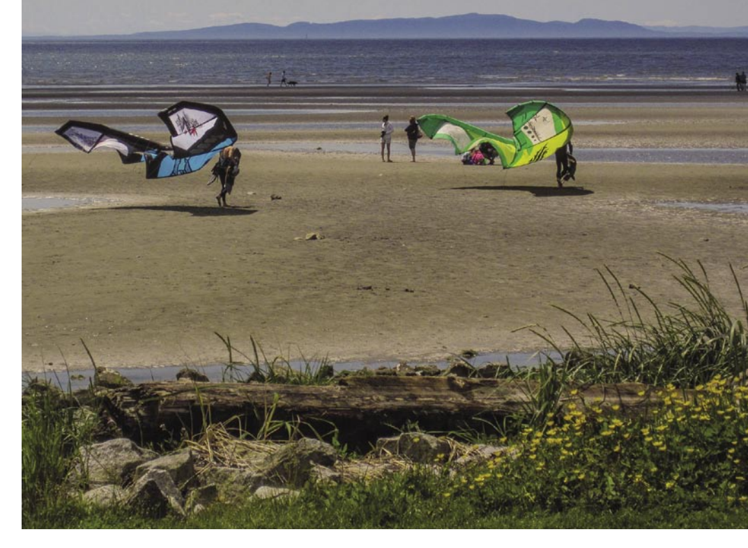
Kite surfers preparing to launch at White Rock—one of myriad ways we use and enjoy our waterfront.

Inspired by New York's Metropolitan Waterfront Alliance (www. waterfrontalliance.org), an astonishingly successful organization, our new initiative is intended to address the mix of social, economic and ecological issues at the edge of our Strait, to be widely inclusive in terms of involvement, and to lead to practical planning tools that can be implemented by local governments home-grown development and protection policies that can guide local decision making through the challenging years ahead. Most importantly, there will be measurable goals and accountability to ensure the goals are met.