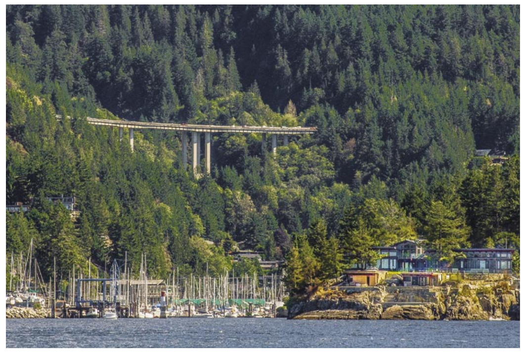
How do we balance the pressures of our homes, transportation and lifestyle? (Eagle Harbour, West Vancouver)

Georgia Strait is a tender, complex ecosystem, supporting thousands of species of marine life. Its heart lies where the mighty Fraser River meets the sea: the largest estuary on the Pacific coast, it's what makes our home one of the