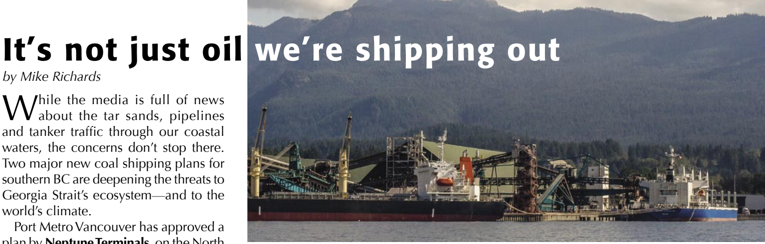
Neptune Terminals on Burrard Inlet.

Another plan, currently being reviewed by the Port, is for a transfer facility at the Fraser-Surrey Docks (FSD), where US coal would be unloaded from trains and moved onto barges. These would be towed to Texada Island where the coal would be stored until being transferred to ships for overseas export. FSD forecasts it would handle two million metric tonnes of coal in 2013, increasing to four million in 2014.