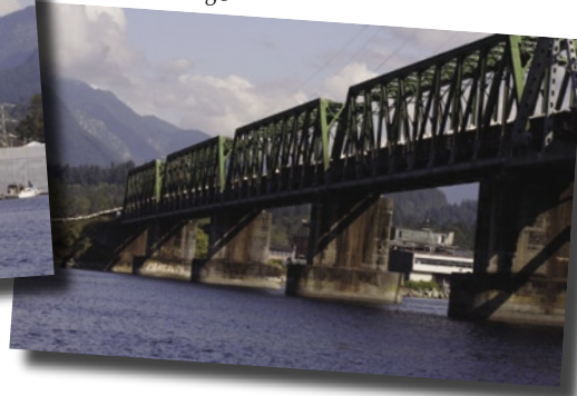
CN Rail Bridge