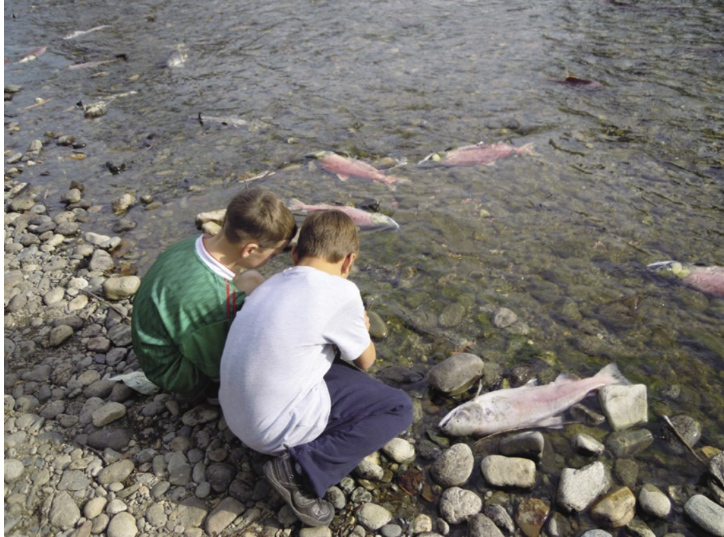
Children learn firsthand about cycles of life and death.

As DFO takes over its new roles, we must make sure they remember that they are also responsible for the health and welfare of that magnificent miracle we witnessed this fall. Not all the Fraser River salmon came back in such abundant numbers, but those that did showed us the amazing resilience and power that is possible. The wild salmon are not gone, and with our help and vigilance, they can and will return to abundance and strength. —RB