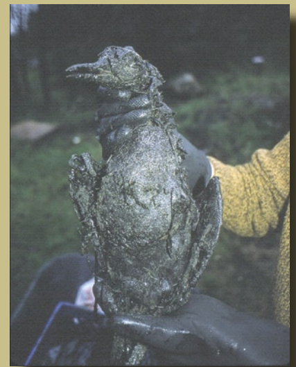
One of over 50,000 seabirds killed in the Nestucca spill.

To put the danger of a major oil spill in our region into perspective, consider this. The largest spill that most readers will remember in our region was in 1988, when a tug rammed the tanker barge Nestucca , which it was towing. The accident occurred off Gray's Harbour in Washington state and winds carried the oil across Juan de Fuca Strait, landing on beaches on the west coast of Vancouver Island. The Nestucca spill killed an estimated 56,000 seabirds, ruined herring spawning areas and destroyed shellfish and crab fisheries. All the damage came from just 5,500 barrels of oil. Today, each tanker coming out through Burrard Inlet carries, on average, 83 times this amount—which is 700 times the rated clean-up capacity currently available in Burrard Inlet.