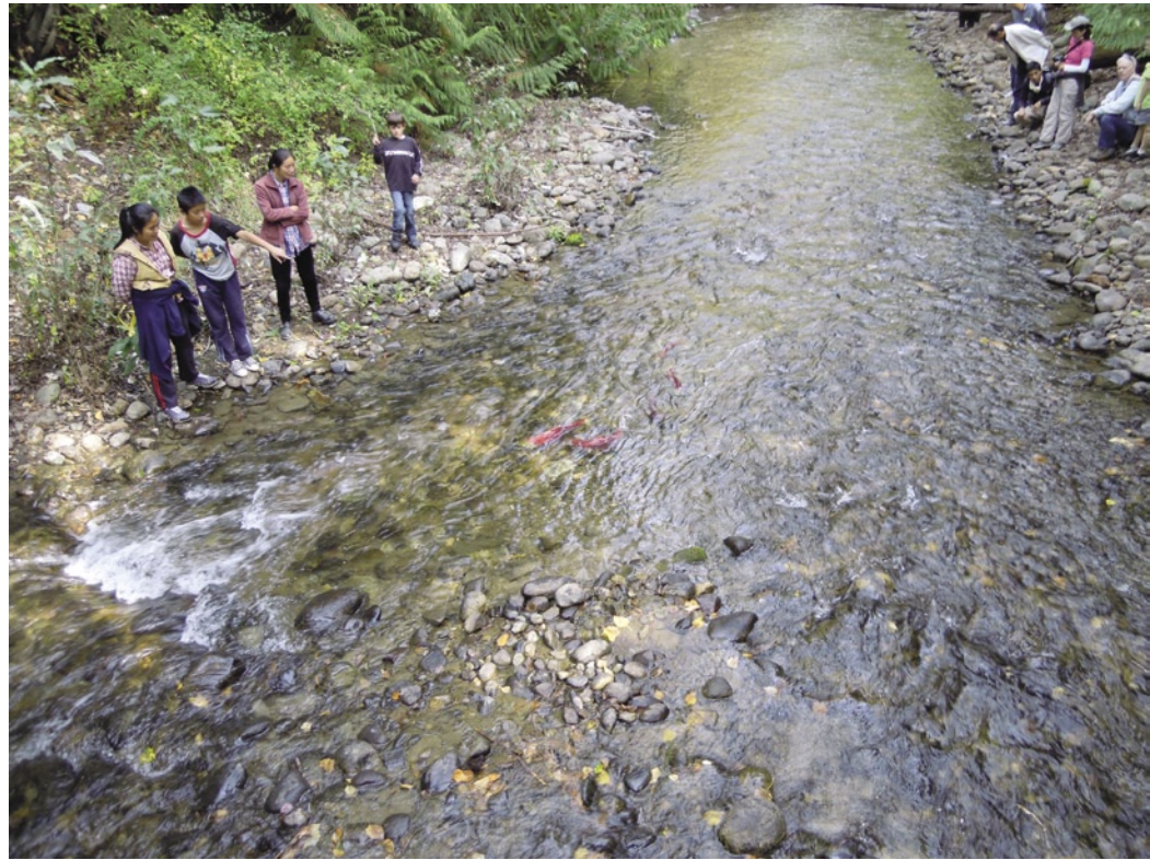
Returning salmon at the Adams River.