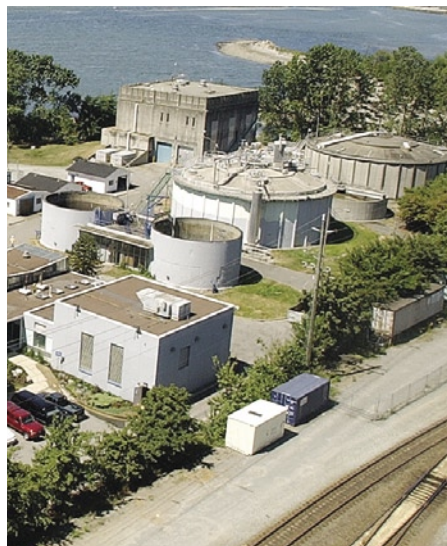
The existing Lions Gate sewage plant.

See page 5 for the good news for Victoria, Metro Vancouver and other communities on this important issue.