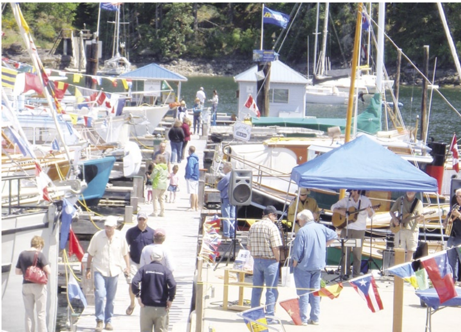
Maple Bay Marina was a busy place during their Wooden Boat Festival.

Boating season may be over for this year, but our work continues. GSA is always happy to meet with marinas, boating clubs and other groups, to give a presentation or workshop, provide information or discuss the Clean Marine BC program and how we can all reduce our impacts on our cruising waters. Please call or email me if you're interested: 250-753-3459, cmcb@georgiastrait.org .