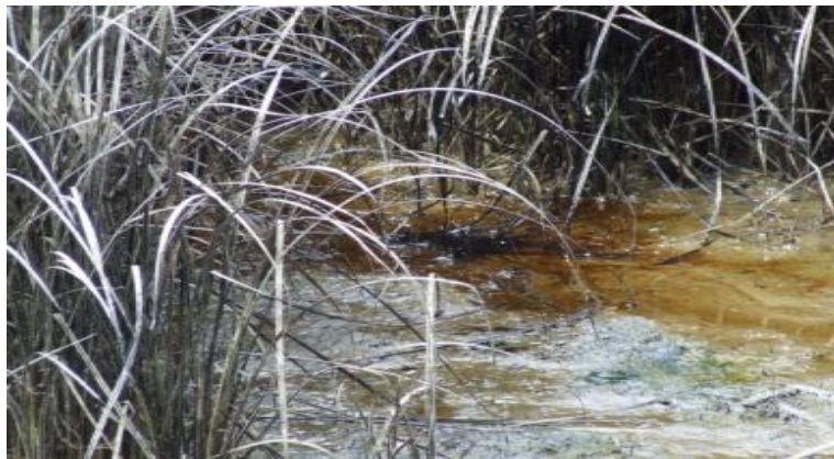
Oil from the Westwood Annette spill in the sensitive Squamish River Estuary

* Updated June, 2013 - Information contained in this document is believed correct at time of publication. Please advise us of any errors or omissions.