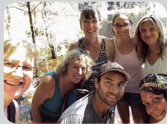
GSA team breaks from a hiking adventure to take a selfie

Thank you for lending your support. Let's hope our collective voices are heard loud and clear: the 80 remaining southern resident orcas in the Strait are depending on it.