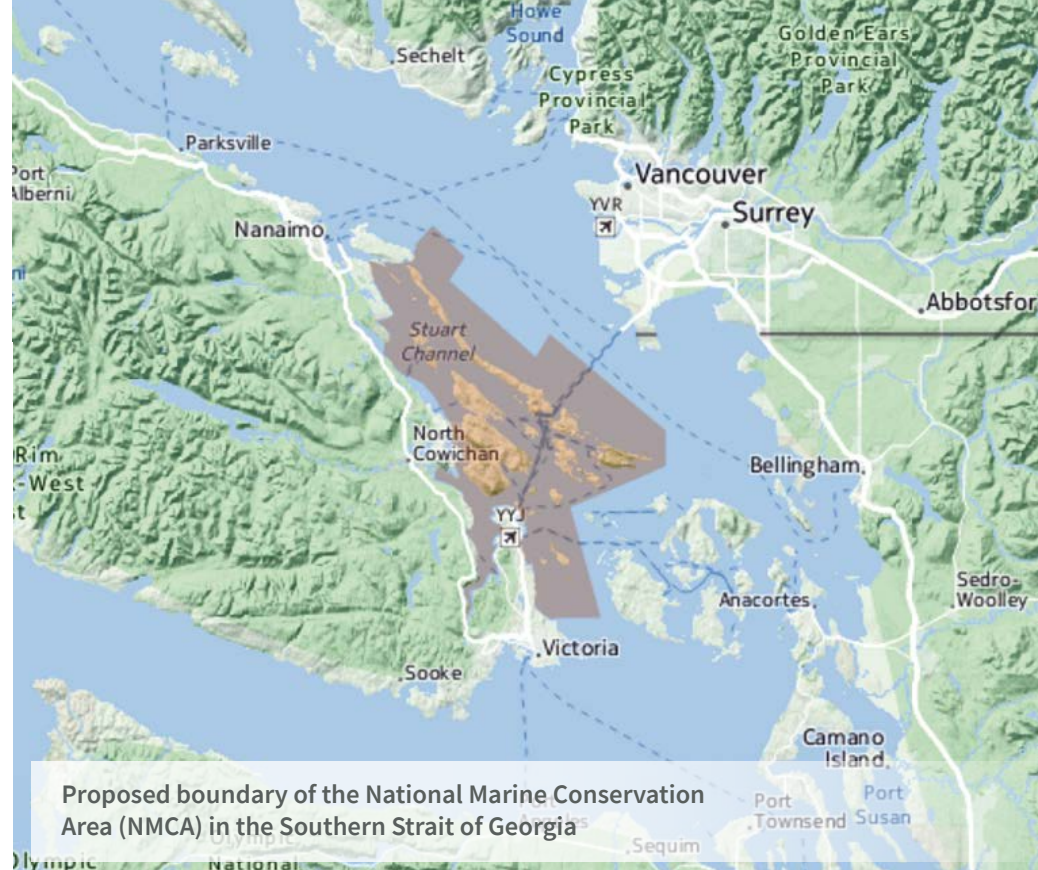
Proposed boundary of the National Marine Conservation Area (NMCA) in the Southern Strait of Georgia

An NMCA will not solve all of the existing threats to the Salish Sea; however it is one of the many tools that we may ultimately use to ensure protection of this incredible ecosystem and the species within it. It is a solid first step to restore and protect thriving marine ecosystems, as it comes with management tools, including monitoring and enforcement, that will be a solid step forward for this region.